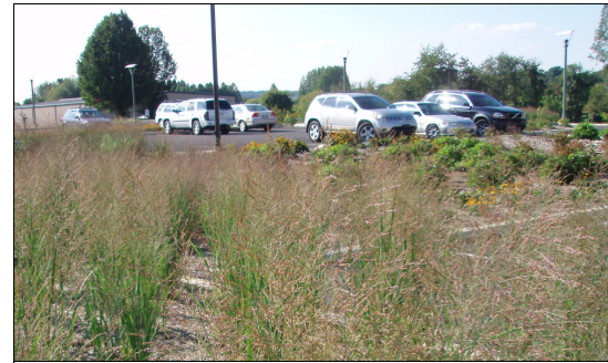
Native warm season grass meadow at the Dansko headquarters near Philadelphia

Want to save money on maintenance while keeping a neat appearance to your landscaping? Utilize the principles of a Vista Lawn – mow turfgrass near the facility, but as you get further away from the buildings, let grasses grow taller and plant shrubs and trees.