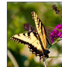
The Bayer Corporation's U.S. headquarters in Pittsburgh covers 300 acres, 200 of which are managed as wildlife habitat and as an outdoor classroom.