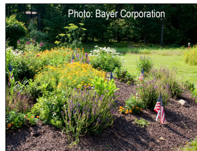
Perennial flower pollinator garden at the Bayer Corporation U.S. Headquarters in Pittsburgh

Warm season grasses are more beneficial for a variety of reasons: they are typically mown just once a year; they should not need synthetic fertilizers once they have established (which takes 2-3 years time); their roots are deeper, helping to reduce erosion and absorb stormwater; and they provide food and shelter for various beneficial insects and wildlife. Native perennial wildflowers, sedges and other groundcovers can also offer many of the same benefits, which result in maintenance cost savings.