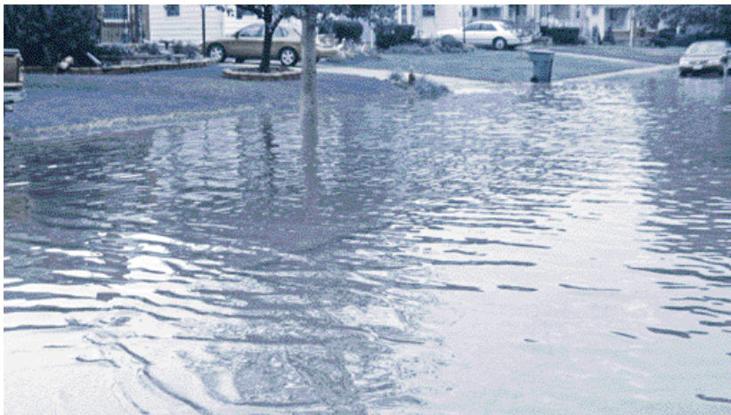
Street flooding results from overwhelmed stormdrains. Diverting run-off from your property into a rain garden can reduce these consequences.

Use low maintenance ground covers or cover bare earth with mulch.