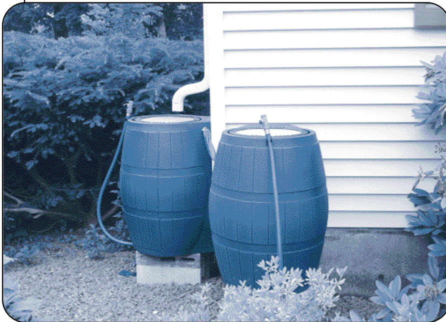
Rain barrels plumbed in tandem.

A rain barrel should be emptied and rinsed out once a