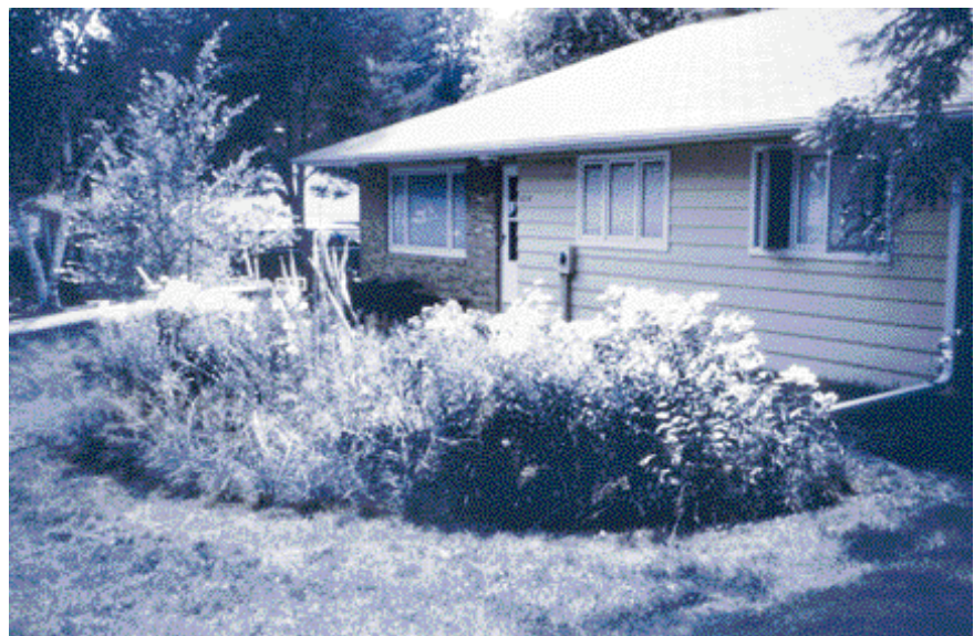
An established rain garden.

These shallow depressions or retention ponds hold runoff